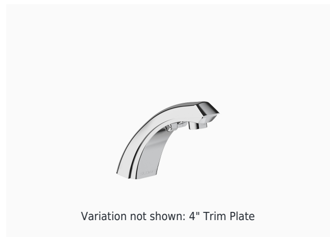
Variation not shown: 4" Trim Plate